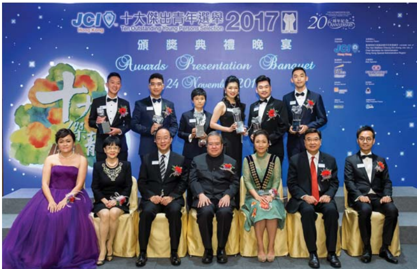
A group photo taken in Top Ten Outstanding Young Persons Selection 2017, with Guest of Honour sitting in the middle and to the right of National President

Generally, with two individuals, the most important person, or highest-ranking officer, is on the right. With a group, the most important person, or highest ranking officer is in the middle, the next ranking individual is to the right, the third ranking individual is to the left, and continue alternating until everyone is arranged.